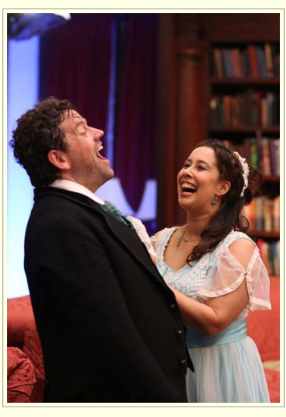
15 Jun 2015