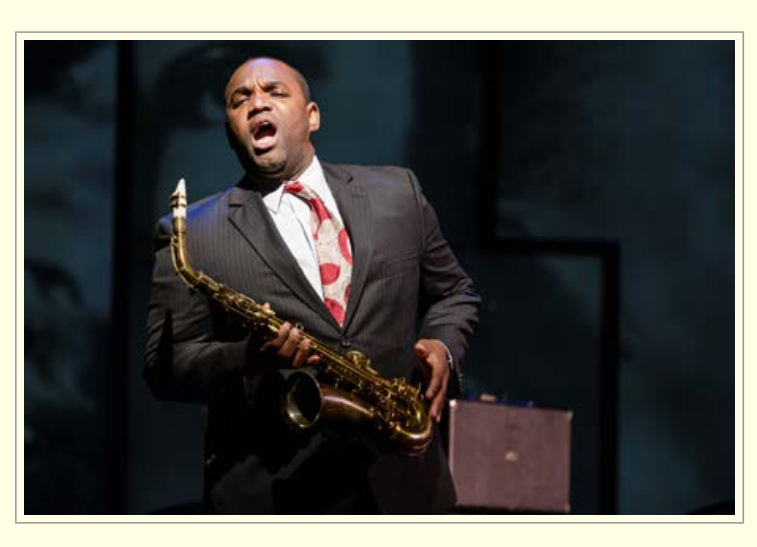
18 Jun 2015