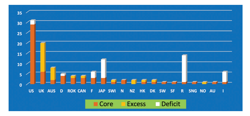
Fig. 3 Percentage of Top 100 Global Performing Arts Training Institutions (compared to share of total population in these countries)<sup>107</sup>

A second and even more important trend that has diminished Italy's role in the opera world involves secular education. Whereas Protestant countries (as well as Catholic Eastern Europe, Orthodox Russia, significantly Protestant Korea, and China) have offset the decline of religious music with more intensive vocal training in secular schools, conservatories, universities and opera house studio programs, Italy has gone in the opposite direction. Everyday training in Italian primary and secondary schools is disappearing and, as Figure 3 shows, the country now hosts considerably less than its proportional share of top musical conservatories and universities.